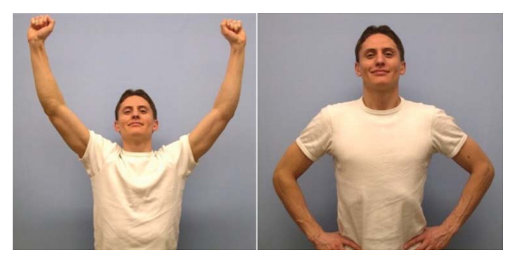
Figure 1 Prototypical pride expressions, with arms raised ( left ) and arms akimbo ( right ). Both displays are reliably recognized at high rates in educated Western samples and by members of isolated small-scale traditional societies. Figure adapted from Tracy & Robins (2007b).

highly isolated, largely preliterate, traditional small-scale societies in Burkina Faso and Fiji who had almost no exposure to Western cultural knowledge (Tracy & Robins 2008b, Tracy et al. 2013). These findings suggest that the pride expression is likely to be a human universal, as it passes the maximally divergent populations test (Norenzayan & Heine 2005): It is reliably recognized by individuals who hail from divergent cultural backgrounds and are geographically separated. In other words, the Burkinabe and Fijians who demonstrated reliable pride recognition are unlikely to have learned about the expression through cross-cultural learning (e.g., North American media).