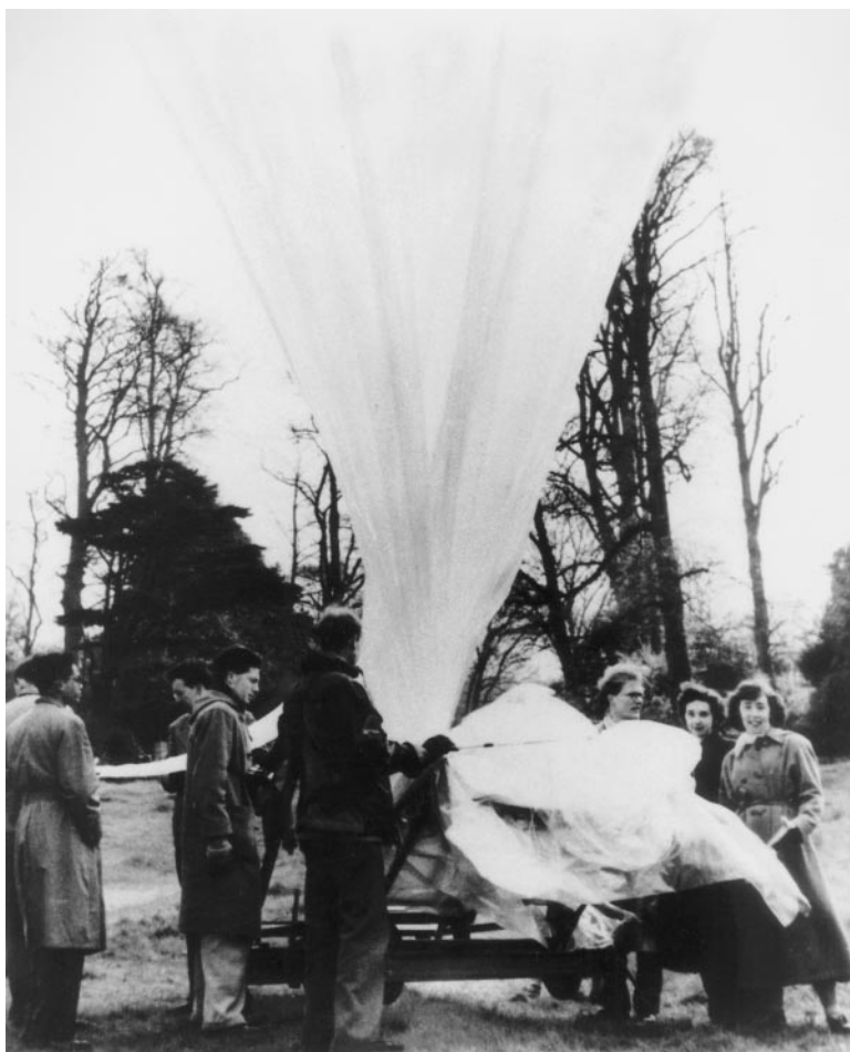
Figure 1 A balloon ready for the ascent in the Sardinia area in July 1953. For the first time, emulsion stacks were made up of 40 stripped emulsions bound together between thick glass plates, wrapped and sealed and subsequently marked with X-rays.

microscopic scanning. These launchings, with balloon fabrication concentrated at Bristol and Padova but the responsibility of preparation divided among many laboratories, were soon organized. Figure 1 shows a launch demonstration. Cagliari, in Sardinia, was chosen as the launch site. The balloons floated at constant height for some hours, after having reached an adequate altitude (between 20 and 30 km), and the emulsion loads were then liberated and dropped down with a parachute on the sea, where a ship was ready to recover them. About half were successfully recovered. The collaboration involved a large number of European universities, 22 laboratories from 12 countries.