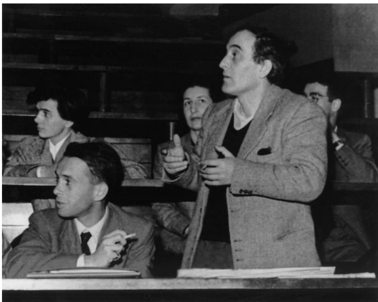
Figure 3 Beppo Occhialini talking in favor of the G-stack exposure at the Pisa Conference.

The G-stack was launched over Northern Italy, near Genova, six months after the Padova Conference. Because of the heavy weight of the package and the huge cost of the emulsion block, it was decided to make a single launch, and to hope for good