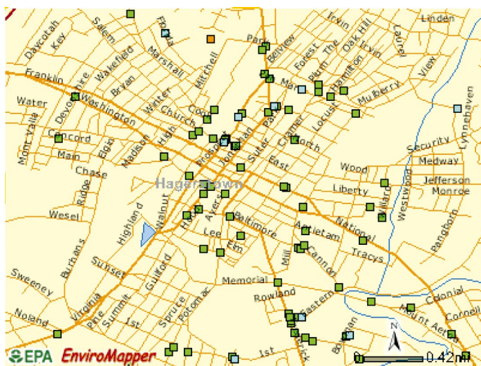
Figure 3 EPA's "Window to My Environment" allows users to identify sites in many locations. In Hagerstown, MD, a Superfund Site (Central Chemical) is shown by orange icon to the north. The company at one time was involved in the manufacture of pesticides, and some material was placed in a dump adjacent to the plant. Toxic release facilities are shown in blue and hazardous waste in green. Many cities can be queried for these and other environmental conditions (EPA WME website, http://www.epa.gov/enviro/wme . Reference 99).